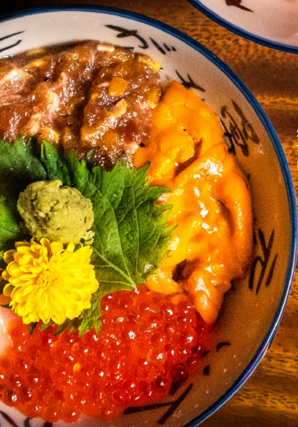
SEA TREASURE DON