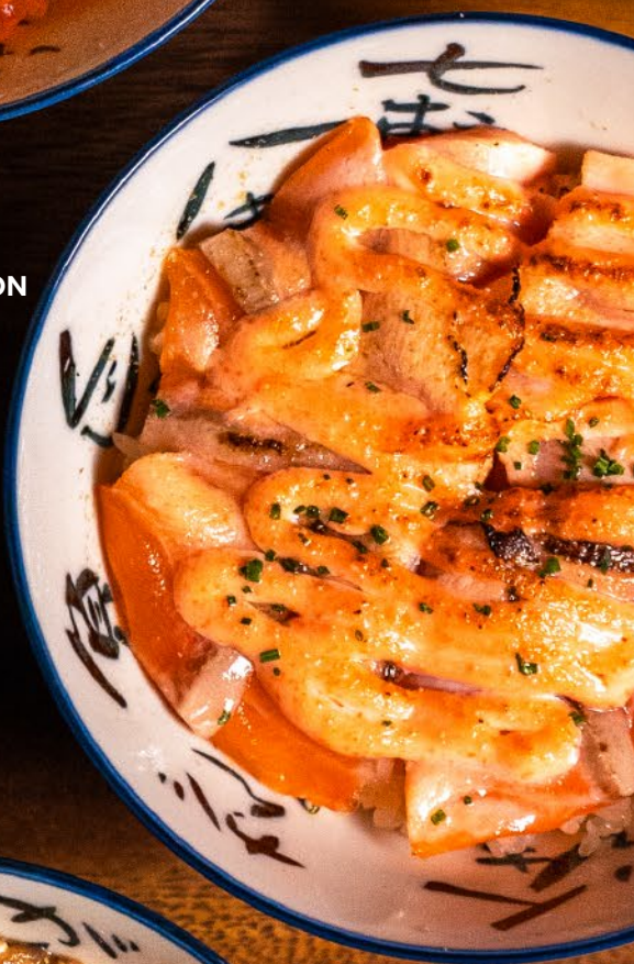
ABURI SALMON MENTAI DON