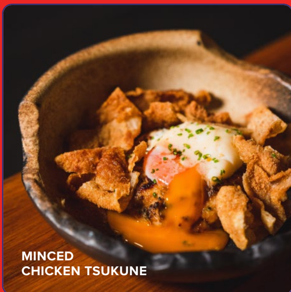
MINCED CHICKEN TSUKUNE