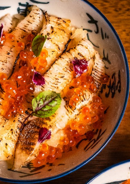
ABURI ENGAWA DON