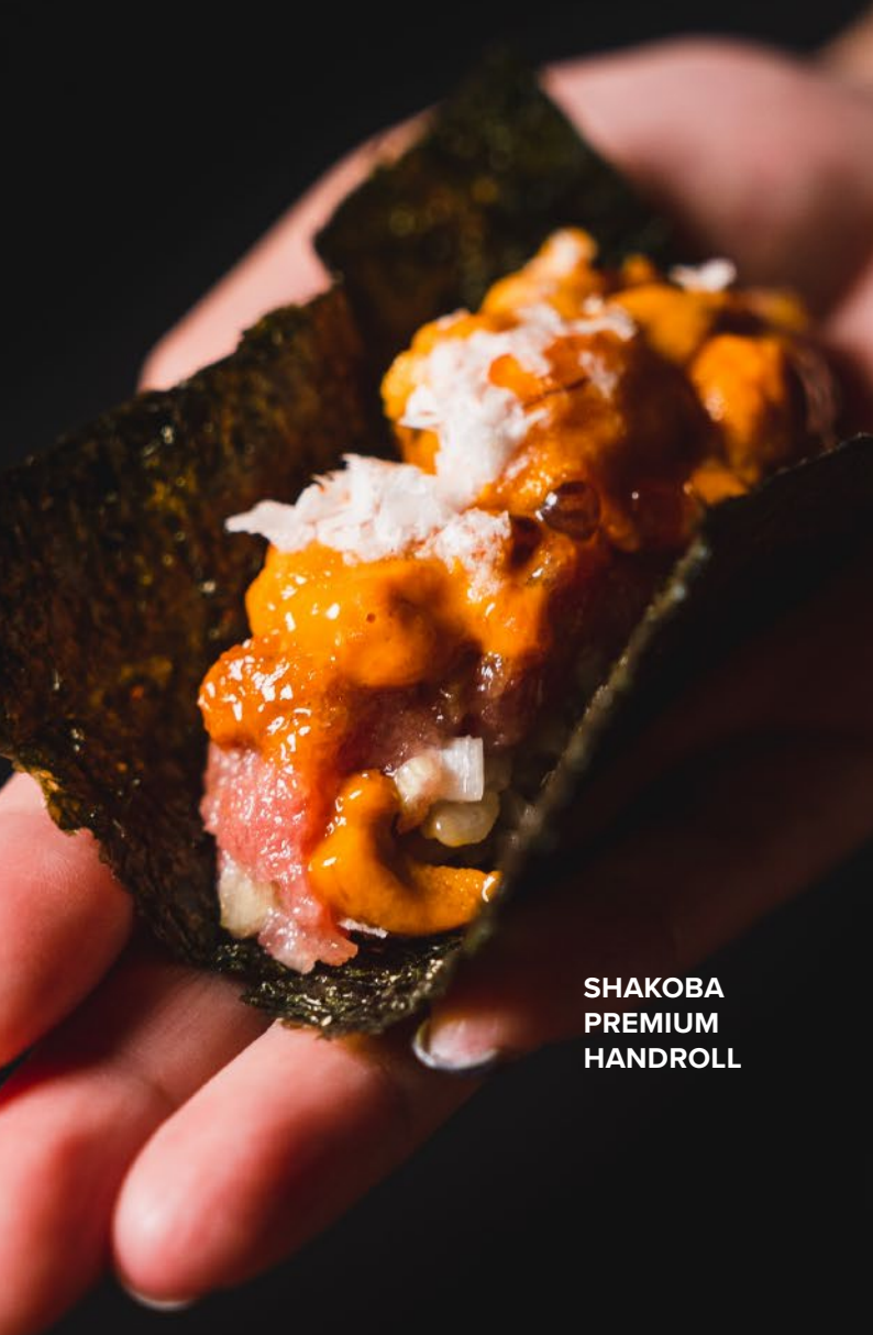
SHAKOBA PREMIUM HANDROLL